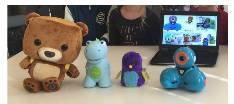
Figure 1. The set of IoToys that was used in our study. From left to right: Fisher-Price's Smart Toy Bear, CogniToys Dino, Hatchimals and Wonder Workshop's Dash.