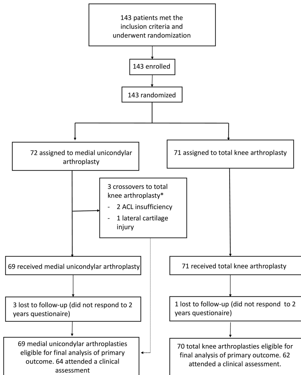
Figure 1 Flow chart. *Included to final analysis according to intention-to-treat principles.

sports and recreation score (4.3 points; 95% CI -3.0 to 11.6; p=0.2452 ), and quality of life score (2.1 points; 95% CI -4.8 to 9.1; p=0.5472 ) at 2 years.