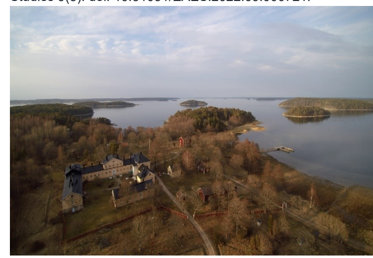
Figure 3. The field station of Archipelago Research Institute / Turku University on the island of Seili, SW Finland.

Reference: Hänninen, J. 2022. The Baltic Sea Ecosystem Regulation Mechanism. Environmental Analysis & Ecology Studies 9(5). doi: 10.31031/EAES.2022.09.000721.