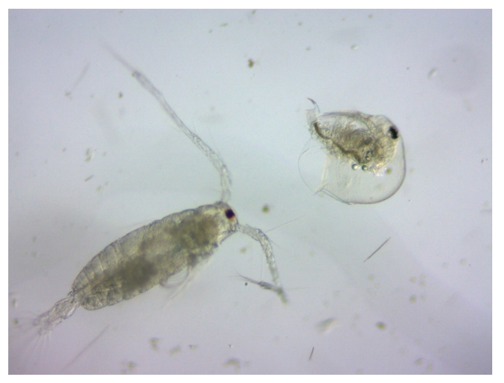
Figure 1 . Acartia spp. and Bosmina longispina maritima individuals under inverted microscope.