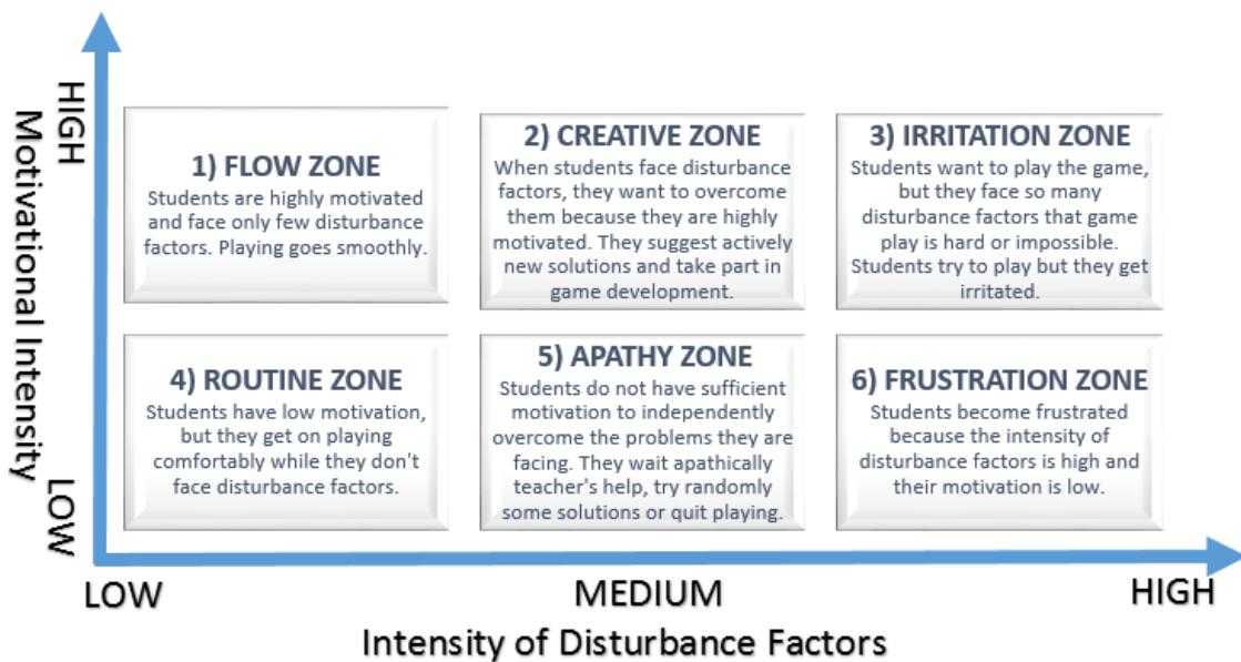
Fig. 4. Six different zones of learning according to motivational intensity and intensity of disturbance factors

6) FRUSTRATION ZONE : With high intensity of DFs, students become frustrated. This state of mind affects negatively to learning; students do not want to overcome the DFs or learn the content.