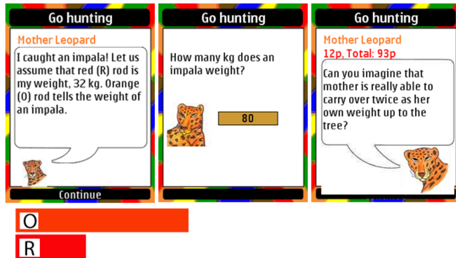
Fig. 2. Example of UFractions problem

The leopards interact with the player through the mobile phone screen. Through this interaction, the player gains information on the leopards' lives and fraction theory. The aim of wrapping an appealing story around the pedagogical content was to make the players feel as if they would be playing and helping the leopards, not merely learning. The story is presented through the means of text, images and sound.