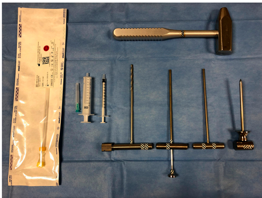
Figure 1. Instrumentation for MRI-guided bone biopsy (4 mm set). From left to right: 20-G puncture needle, needle and syringe (21 G/10 mL) for local anaesthetic, syringe for gadolinium-contrast agent (for skin entry point marking), manual spiral drill, two different kinds of cavity drill (one with ejector), trocar and mandrin for bone entry and top crosswise, a hammer. Note: MRI: magnetic resonance imaging.