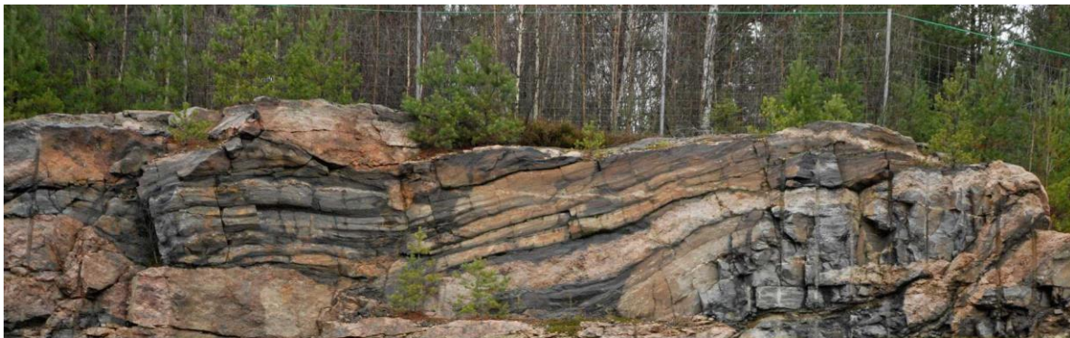
Figure 1. Subhorizontal supracrustal rocks and granitoids along the E18 motor way road cut in the Salo area.

Opposing to the surrounding areas, the Salo area is characterised by gently-dipping structures, including common isoclinal recumbent folds within paragneisses and volcanic rocks. These folds are intruded by subhorizontal sheets of granitoids (Figure 1; Aho et al. 2014).