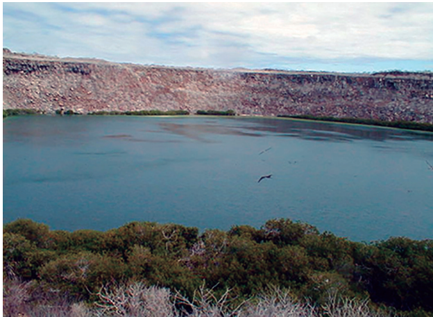
Figure 2. Photo of Lake Arcturo.

covers the lakeshore. The northeastern shore of the lake has a shallow-water beach area, whereas the southern part of the basin has much steeper bathymetry. Although the lake is connected to the ocean through many fissures in the island basalt a distinct seawater inlet is not obvious. Stable isotope values of water, as well as major cations and anions, indicate that the lake is hypersaline, with salinity roughly 1.5 times that of seawater (Conroy et al., 2014). The lake is frequented by large numbers of seabirds and is an outstanding example of guanotrophy. Primary production in the epilimnion is high, and the hypolimnion is usually anoxic. The lake is probably stratified during the entire year (Walker & Likens, 1975; Bryhn, 2009). There appears to be no fish in the lake. The invertebrate fauna is dominated by corixid bugs and tanaid shrimps (Howmiller, 1969). More information on this lake is given in Conroy et al. (2014, 2015).