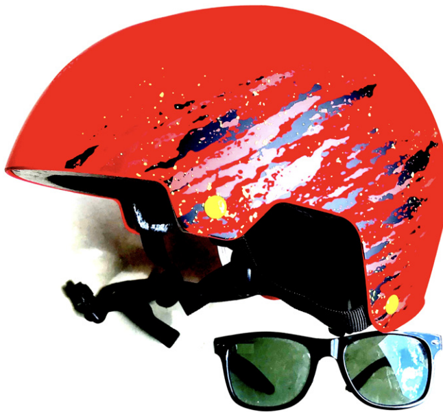
Figure 4. Alien radiation protection kit.

The next two proteins are highly similar to opsin channels. These are light-activatable transmembrane proteins capable to polarise or depolarise neurons, provided light with the correct wavelength is used. The first peptide is highly similar to the red-light-activatable Na channel, ReaChR. The second protein is homologous to the halorhodopsin (NpHR) pump. This membrane pump is specific for chloride ions ( \text{Cl}^- ) upon yellow light activation. \text{Cl}^- pumping inside the cell has the potential to inhibit the action potential in neurons.