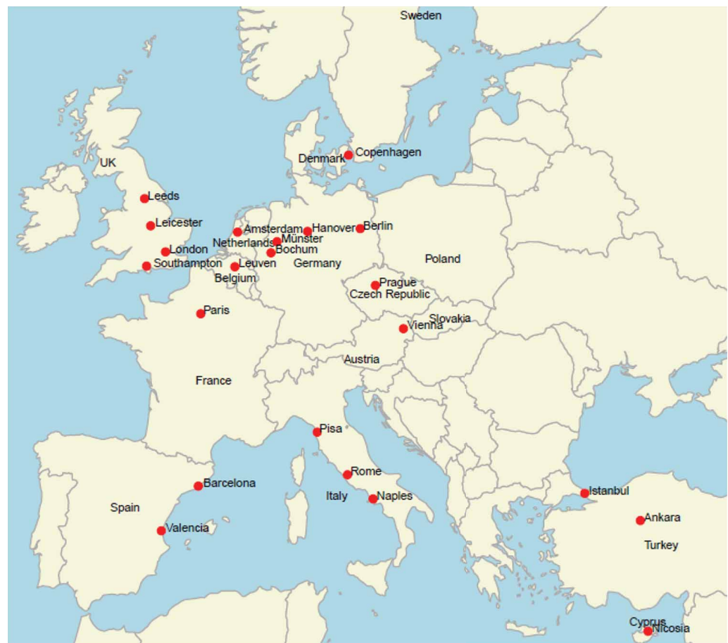
FIGURE 1 Map showing the participating centres of the clinical trial network for primary ciliary dyskinesia (PCD-CTN) (red dots). The PCD-CTN consists of 22 trial sites from 12 European countries including >3000 children and adults with PCD. The map was created with R [16] and RStudio [17], the packages “maps” [18], “ggplot2” [19] and “dplyr” [20] were used.

The ERN-LUNG International PCD Registry was initially launched in 2014 within the BESTCILIA project [15]. It has lately been expanded through the REGISTRY WAREHOUSE project of ERN-LUNG [2]. The registry aims to facilitate the recruitment of patients for clinical and research studies. Data on family history, symptomatology, socioeconomic status, clinical manifestations, disease course, treatments, outcomes and natural history, as well as diagnostic data, are collected. Patient data are continuously contributed by participating centres [2]. To participate in the ERN-LUNG International PCD Registry the centres need to meet the necessary legal and ethical requirements, which are dependent on national conditions. The registry management team assists with all necessary processes. Participation in the registry is mandatory to become a member or associated partner of ERN-LUNG PCD Core. The ERN-LUNG International PCD Registry is registered in the European Rare Disease Registries Infrastructure ( https://eu-rd-platform.jrc.ec.europa.eu/erdri_en ).