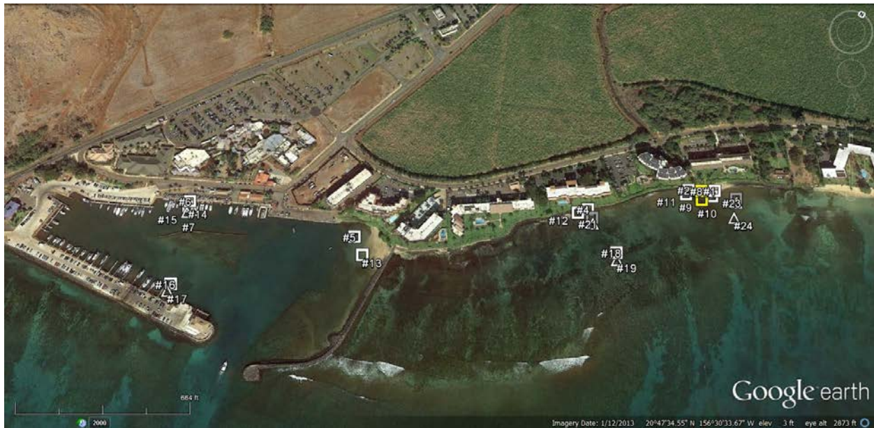
Figure 2. Sampling locations along Maalaea Bay, Maui, Hawaii. White squares indicate surface samples, white triangles indicate subsurface samples, and yellow squares mark stations that tested positive for Diuron in concentrations greater than 3 ppb (#8 and #9).