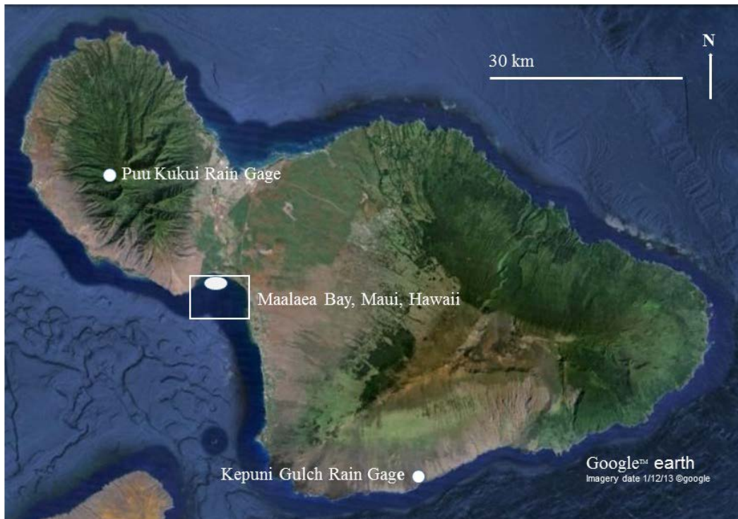
Figure 1. Maalaea Bay (square) and sampling site (oval), Maui, Hawaii, in relation to the local topography. The two rain gauges on Maui, Hawaii, are at Puu Kukui, Maui, Hawaii, in the north at 1,759 meters elevation and at Kepuni Gulch along the southwestern coast at 77.7 meters elevation ( http://hi.water.usgs.gov/recent/hawaii ). Data: LDEO-Columbia, NSF, NOAA, U.S. Navy, NGA, GEBCO. Image: Landsat. © 2014 Google.