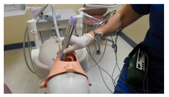
Pictured: Mannequin, typodont and participant with EMG electrodes attached to skin over 4 muscle sites for recording electrical activity of muscles.