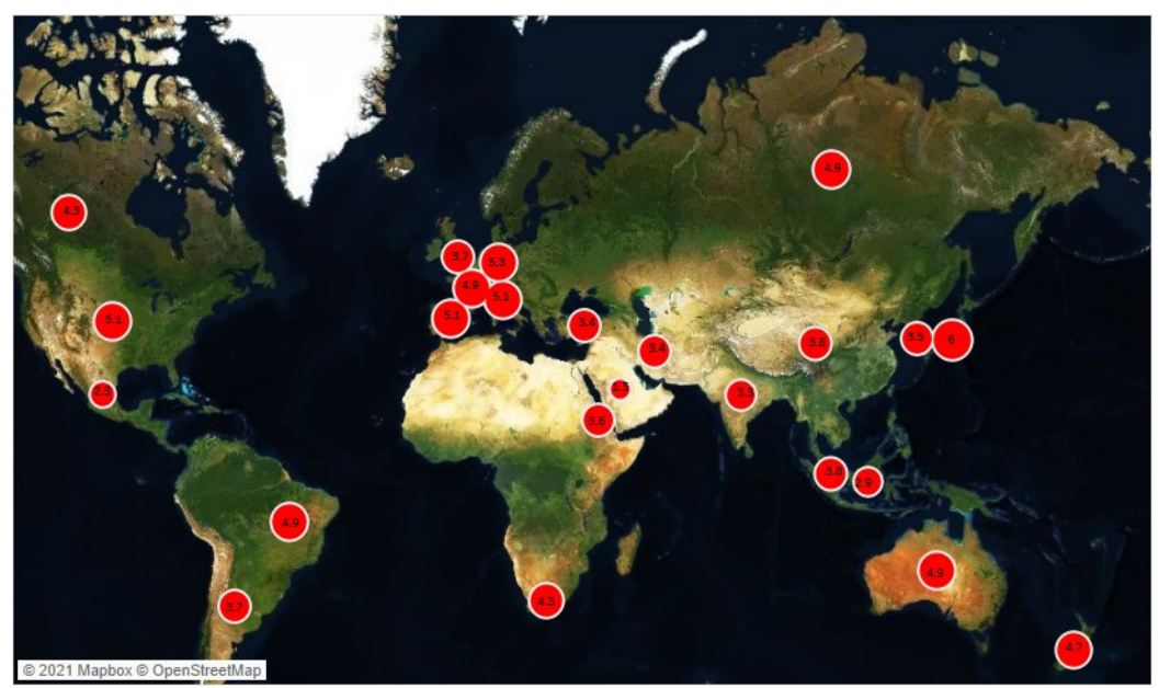
Figure 2. The Average of GDP Loss of Countries and Regions in the World

Note: LSS is Labor Supply Shock, ERS is Equity Risk Shock, CDS is the Consumption Demand Shock, GES is the Government Expenditure Shock, and GDPL is the GDP loss. Sample size is 72.