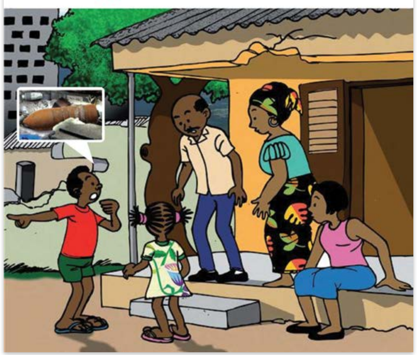
In Bata, Equatorial Guinea, MAG used digital technology to deliver emergency risk education.