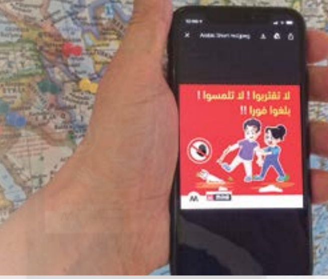
Simple graphics from the pilot project in Ninewa, Iraq.