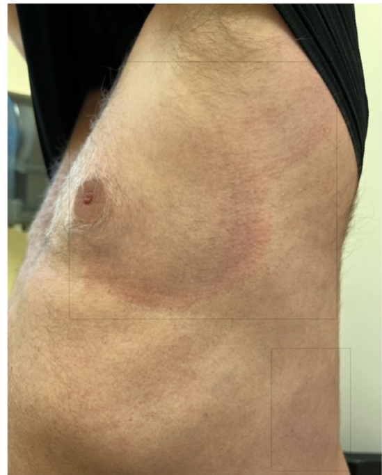
FIGURE 1. Multiple erythematous patches on our patient consistent with Erythema Migrans

On follow-up in the dermatology clinic, the patient reported that he experienced fever and night sweats shortly after beginning doxycycline therapy. He noted that the eruption on his trunk had resolved. The presumed reaction after starting the doxycycline was JHR. For confirmation, Lyme titers were then obtained and were positive. He was continued on doxycycline 100mg BID for an additional 21 days.