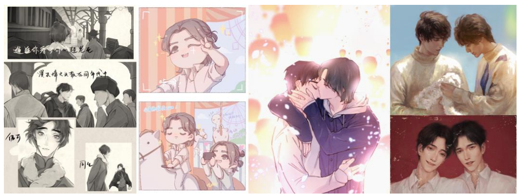
Figure 1. Selected fan art pieces created by Ayanga and Yunlong's fans