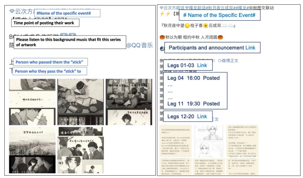
Figure 4. Selected fan-relay posts (participation, archiving); English translations in boxes.