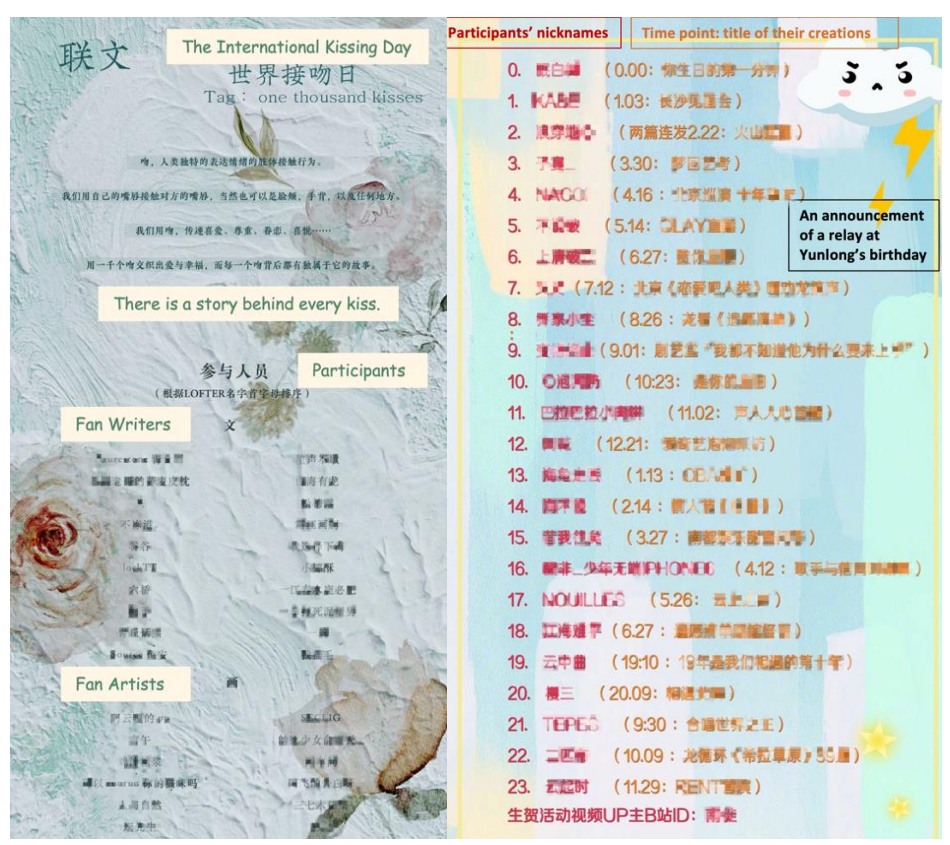
Figure 3. Selected fan-relay announcements (participants' names, both names and time points); English translations in boxes.

Fans then publish their works on Weibo in the scheduled order, "passing the baton" from one creator to the next. These posts often include both the relay tag and phrases such as "I took the baton from @xxx and pass it to @xxx" (see Figure 4, left). While these writers and artists post their works, fan organizers archive the fanworks on Weibo by either reposting them or creating new posts to document the links and/or screenshots of the original fanwork posts. Fanworks created for a relay can be recorded singularly or grouped together in such archiving (see Figure 4, right); other fans not involved in the relay may also sometimes repost/document their preferred fanworks in the same way. Most interview participants regard these general summaries of all relay works as a "good" archiving of fan events, but they focus more on particular fanworks, instead of the entire relay, that they consider interesting.