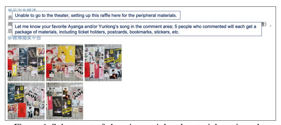
Figure 6. Select post of choosing peripheral material receivers by raffle on Weibo; English translations in boxes.