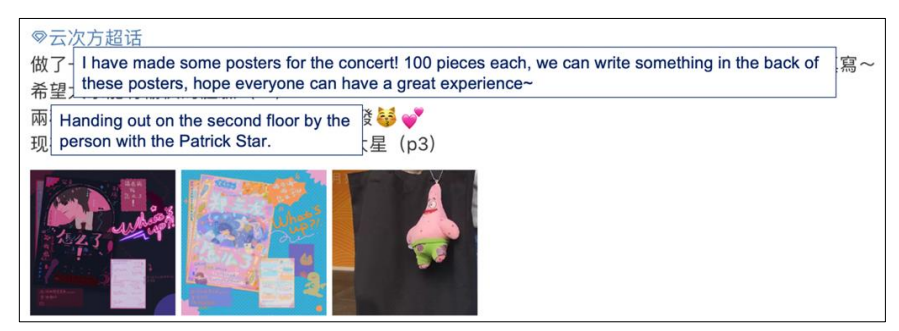
Figure 7. Select post of disseminating peripheral materials in person; English translations in boxes.