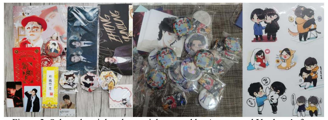
Figure 2. Selected peripheral materials created by Ayanga and Yunlong's fans

As a portion of a broader project studying celebrity fan practices, this research is based upon unobtrusive observation on social media and sequential semi-structured interviews with individual fans. Making no direct contact with participants (Ugoretz, 2017), a two-month-long observation (June-July 2021) was conducted on Weibo, a popular Chinese social media platform that allows users to (re)post, comment, tag, etc. while keeping their name, age, gender, and profession anonymous. For this fanwork communication research in particular, I emphasize fans' posts and comments that pertain to the two main types of activities: digital relay creations and non-digital material disseminations. The observation notes and memos were then open coded and grouped following Elo & Kyngäs' (2008) inductive approach. After these preliminary analyses, the broader project moved to semi-structured interviews (via WeChat) with 30 individual fans (ages between 18 and 50). 11 of these 30 participants have joined in or encountered either/both the digital relay and peripheral material dissemination; the conversations of this topic often lasted 10-15 minutes and focused on fans' own perceptions and experiences. Integrating observational results with interview transcriptions, I analyzed the data