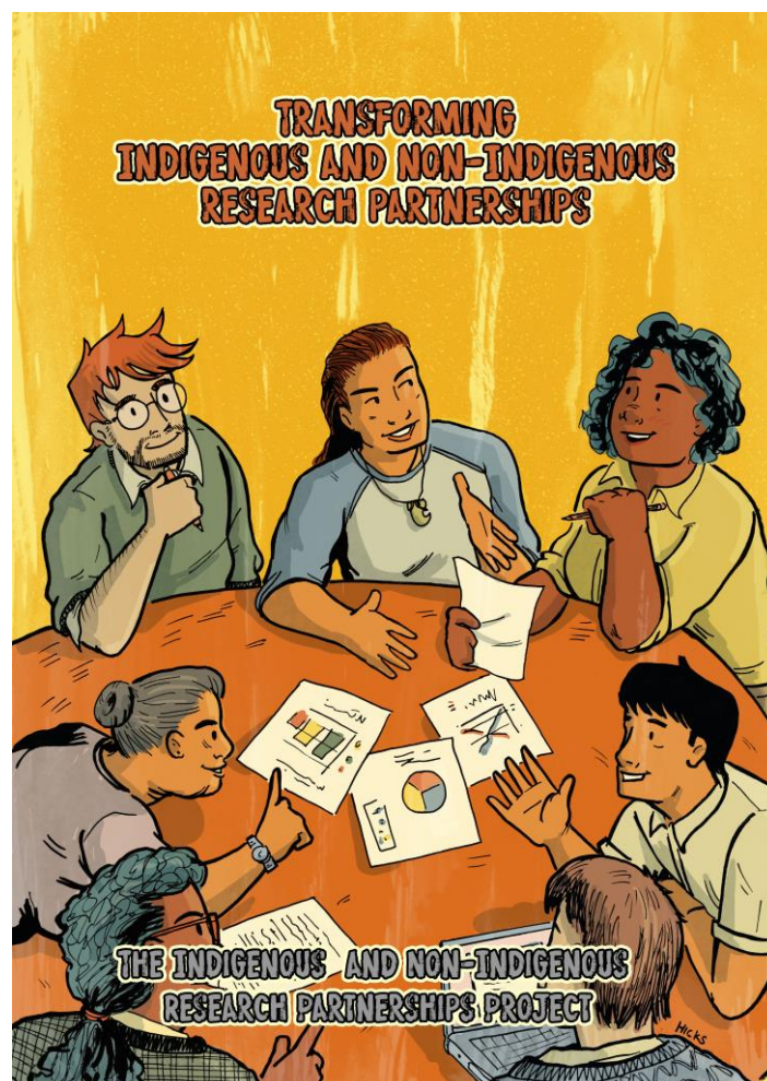
Figure 2 Comic Cover