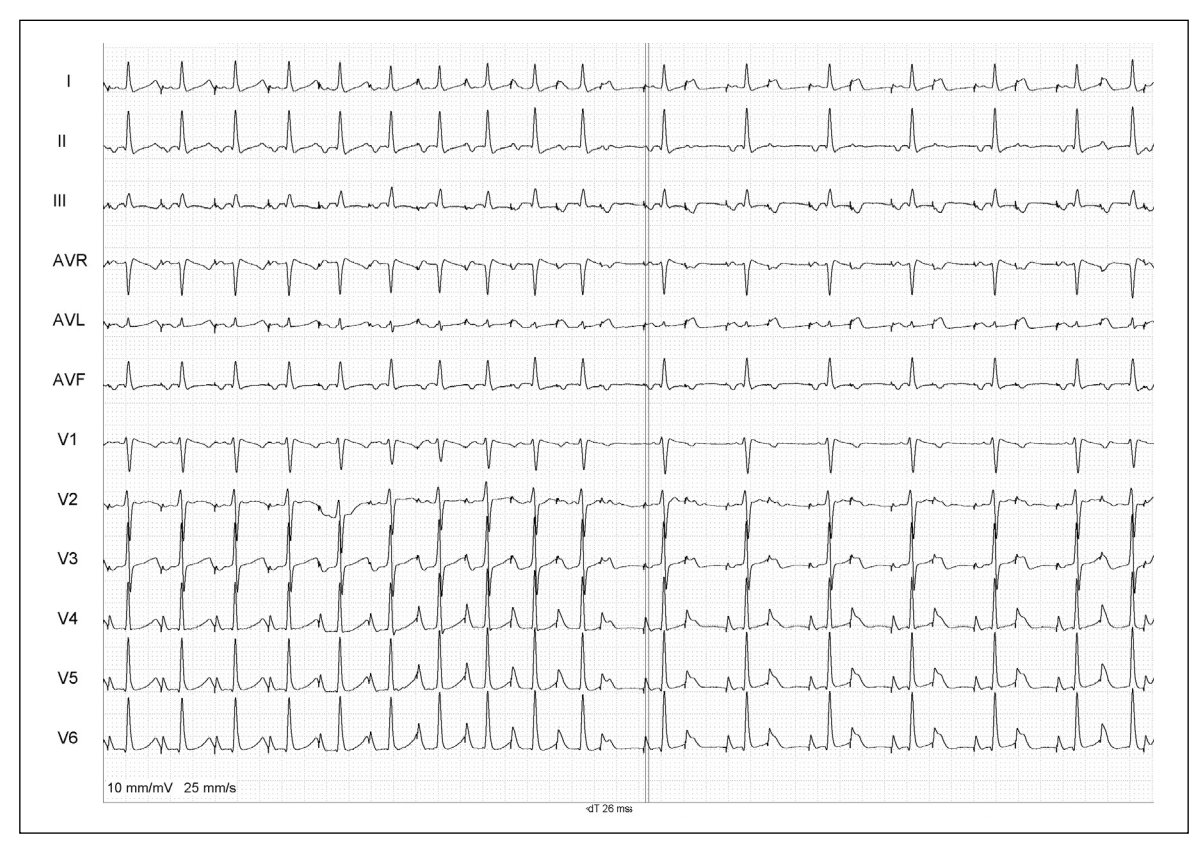
Figure 4. Electrocardiography 45 minutes after ablation, during atrial incremental pacing.