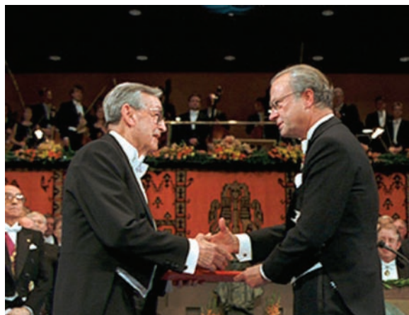
Dr. Furchgott received the Nobel Prize in Physiology or Medicine 1998 [19]