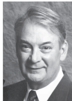
Ferid Murad [30]

Louis Ignarro had worked as a consultant for Herbalife for many years. He was a member of the Herbalife Nutrition Advisory Board [28] and collaborated in developing nutritional supplements. For activities such as promoting Herbalife products, Ignarro was subjected to criticism [29]. Nevertheless, Ignarro's activities have been marked by a number of awards and recognitions, including Merck Research Award (1974), Arthritis Foundation Research Award (1975–1977), Tulane Medical School – Outstanding Teacher Award (1983), UCLA School of Medicine – Outstanding Teacher Award (1986), Roussel Uclaf Prize for Cell Communication and Signaling shared with Dr. Salvador Moncada and Dr. Robert Furchgott (1994), National Academy of Sciences (1999), Canadian Medal of Merit (2008), and many others.