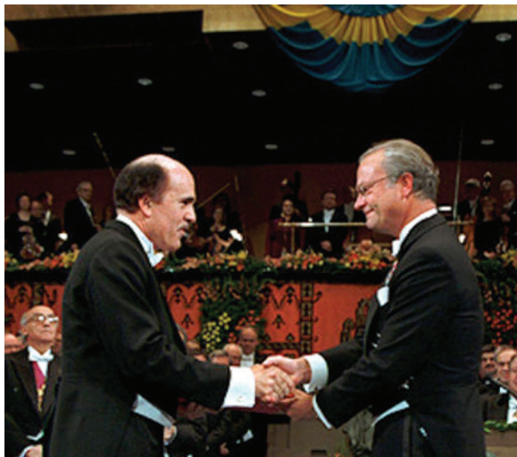
Louis Ignarro receiving his Nobel Prize from the hands of His Majesty the King [27]

to the position of Assistant Professor of Pharmacology at Tulane University School of Medicine in New Orleans. Making a significant contribution to the study of cyclic GMP and cyclic nucleotides in general, Ignarro shifted his attention to blood vessels, given the fact he was quite interested in the Ferid Murad group's work. As Ignarro said: "It occurred to me that nitric oxide might account for the vascular smooth muscle relaxing action of nitroglycerin and that cyclic GMP might be the second messenger responsible for mediation the vasorelaxant effect of nitric oxide" [21]. In 1979, Louis Ignarro showed that nitric oxide could relax vascular smooth muscles [24]. Continuing his research at Tulane, Louis Ignarro finally realized that the properties of nitric oxide were the same as those seen in the endothelium derived relaxing factor (EDRF) identified three years earlier by Robert Furchgott. Ignarro and Furchgott came to similar conclusions about nitric oxide as the EDRF and they both reported their findings at the conferences in 1986. Like a story on DNA discovery, this "scientific coincidence" obviously demonstrates that ideas, when the time comes, are in the air [25, 26]. In 1998, Louis Ignarro shared the Nobel Prize in Physiology or Medicine with Robert Furchgott and Ferid Murad.