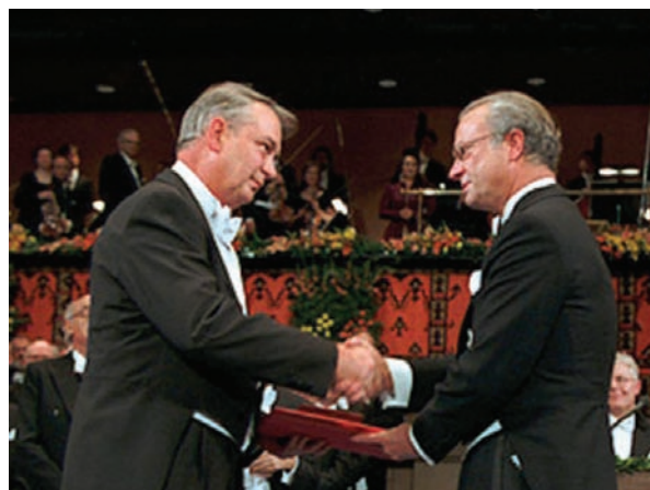
Ferid Murad receiving his Nobel Prize from the hands of His Majesty the King [34]

Previously working on cyclic adenosine monophosphate, he moved on to cyclic guanosine monophosphate in 1970. In 1977, he demonstrated that nitroglycerin and some related heart drugs were pro-drugs converted into nitric oxide in the body. He showed that this colorless, odorless gas acts to increase the diameter of blood vessels, which leads to lowering blood pressure and increasing blood flow. “Since his discovery in 1977 there have been about 150,000 research publications with nitric oxide in various areas of biology” [32]. Later Robert Furchgott showed that cells in the endothelium of blood vessels produce a signaling molecule – endothelium-derived relaxing factor (EDRF), which signals smooth muscle cells in blood vessel walls to relax. Louis Ignarro, independently of Furchgott, identified endothelium-derived relaxing factor as nitric oxide [33]. Thus, independently made research had led to a great scientific discovery that received the attention of the Nobel Committee and eventually the Nobel Prize in Physiology or Medicine 1998, one of the recipients of which was Ferid Murad.