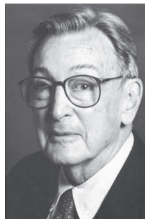
Robert Francis Furchgott [12]

muscle by elevating intracellular cyclic GMP. His discovery introduced “a new principle for transferring signals between cells; a gas as a signal-transferring molecule had never been observed before. The missing steps in the signaling process were duly filled in by Furchgott and Ignarro, for which the three eventually shared the 1998 Nobel Prize” [11].