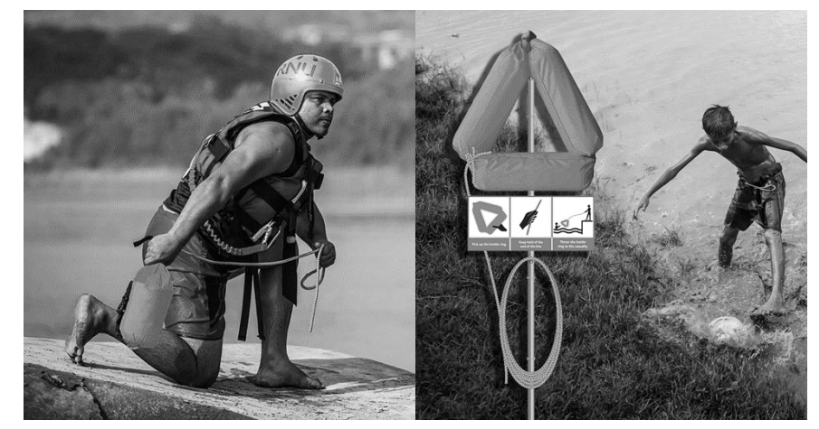
Figure 1. RNLI low-resource rescue equipment designs - throw-line (l) and bottle-ring (r)

These are currently available as open-source resources for lifesavers worldwide. Furthermore, the throw-lines had already undergone rigorous performance testing by the RNLI to standards deemed acceptable to the organisation, in lieu of ISO accreditation. What had not yet been tested rigorously were the manuals.