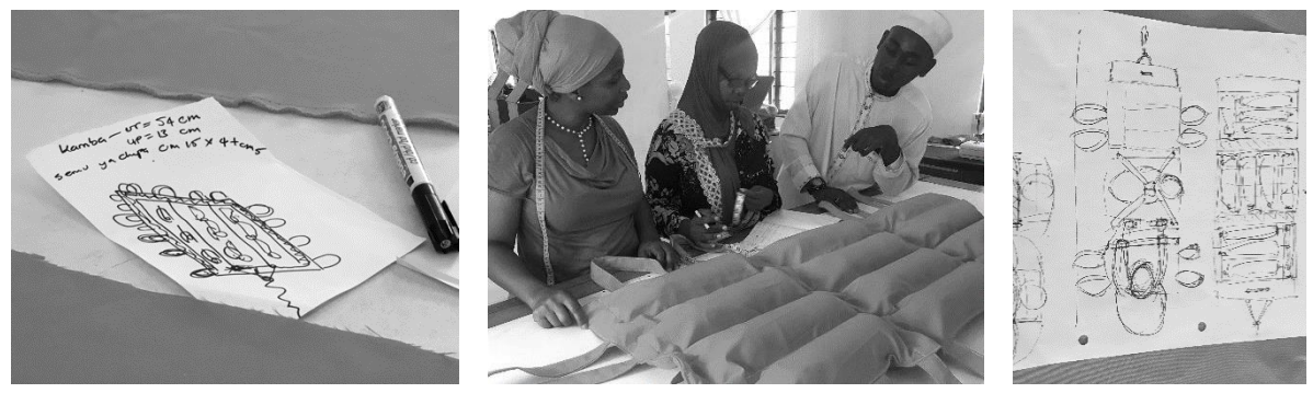
Figure 2. Co-design/ interaction prototyping session led by local tailors

Initially a basic catalogue of defining questions were formulated at the start of the project: WWWWWH – Who, What, Where, When, Why and How (van Boeijen, Daalhuizen, Zijlstra, & van der Schoor, 2017). Most of these questions are outlined in section 1 of this paper. It required the involvement of local tailors in their work environments as well as the introduction and formation of a relationship between the local charities The Panje Project and Pamoja.