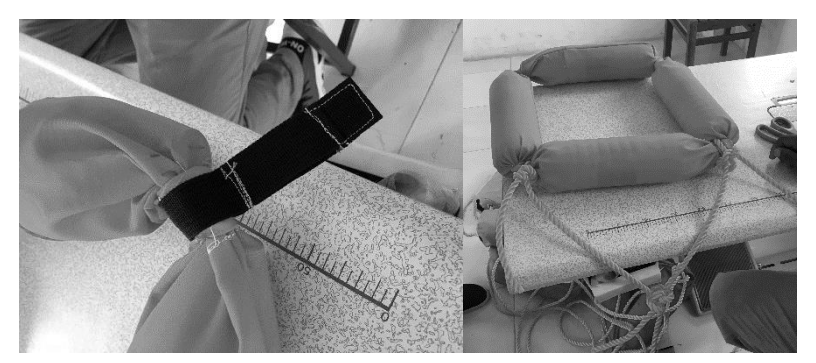
Figure 4. 4-bottled bottle ring variations developed with the tailors taking in consideration RNLI instructions for original rescue ring

The tailors found it very challenging to navigate the making process of the first prototype without any further guidance and were prone to making mistakes. Notably the first iteration of the bottle ring prototypes showed a variety of issues, such as material orientation, product size and weight etc. All highlighted as potential problems prior to prototyping under section 3.1.2. The second iteration after review and discussion was produced with confidence and without fault, highlighting the need to revise