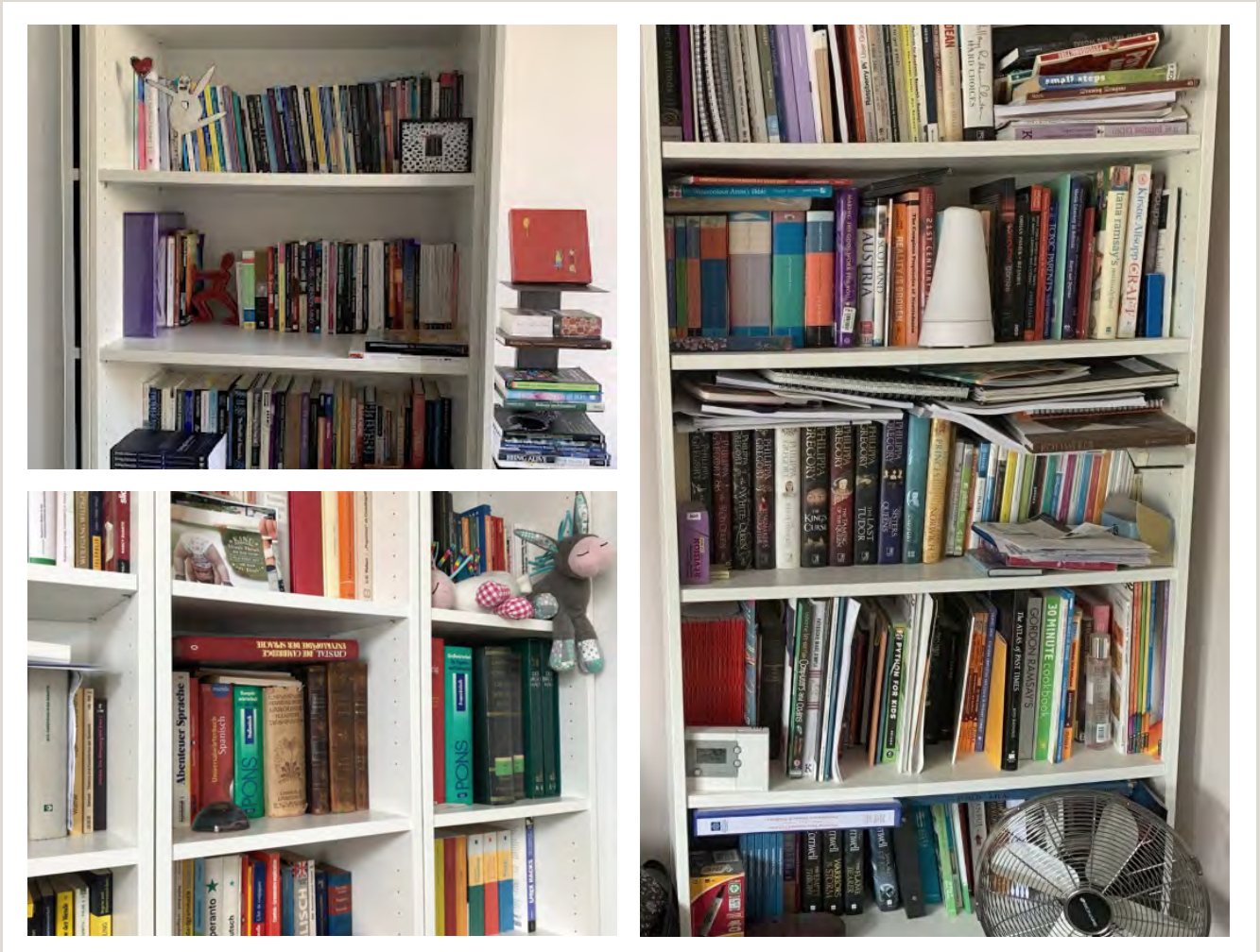
The participants' shelfies