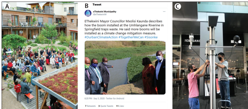
Figure 2: Three examples of how integration can be enabled

(A) Freiburg, Germany: citizen action can be harnessed to create a cultural change in values that enables broad integrated action (credit Daniel Schoenen). (B) Durban, South Africa: multi-institution connections can lead to opportunistic integrated measures (photo shows an example of integrated water and climate change adaptation, from Twitter 67 ). (C) Singapore: the use of big data can allow for modelling of integrated actions to assist decision makers (credit Winston Chow).