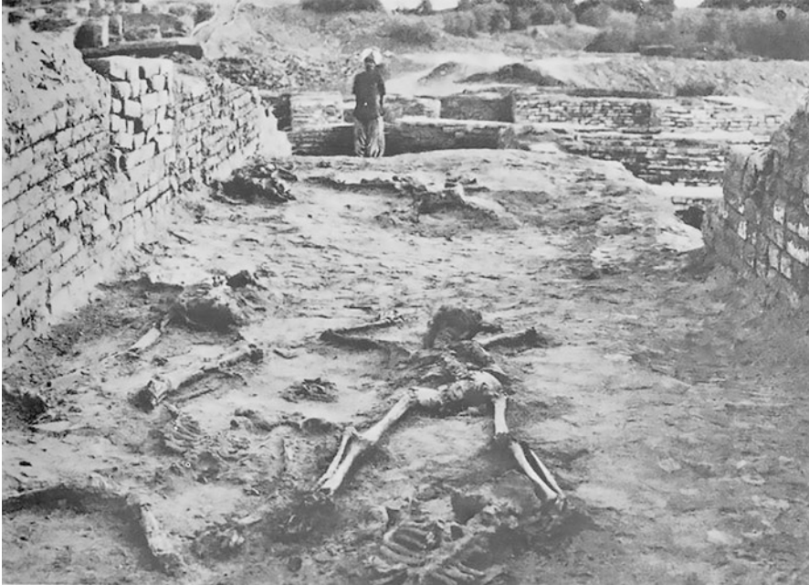
Fig. 3.2 Mohenjo Daro skeletons are not found in what would be considered a formal cemetery. These individuals in the lane between houses in the VS Area are typical of the site, wherein most of the skeletons are found in public lanes and residential areas.