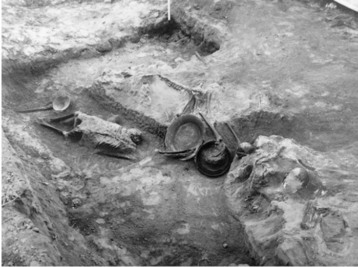
Fig. 3.3 Photograph of the partially complete excavation at Harappa's Area G, Trench II. Photo taken by M.S. Vats from the North-East corner of Am 42/22 in the 1928–1929 excavation season. (Reproduced from the original at the British Library)

burial (G.289) whose cranium was removed and placed to the left of the body when it was interred, which suggests the decapitation occurred as part of the mortuary ritual (Robbins Schug et al. 2018).