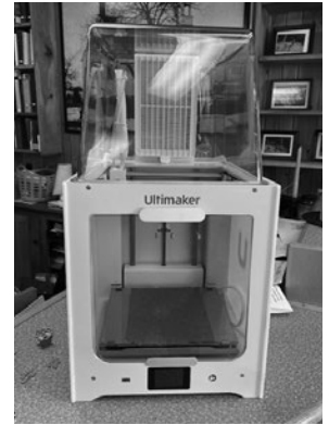
New Ultimaker 3D Printer

On May 1, we proudly reopened to the public. Our programming returned as well, and included the weekly knitting circle, summer reading program "Tails to Tales," monthly book clubs, and new this fall, weekly Mahjong. In September we added a 3D printer through the assistance of a grant through the Institute of Museum and Library Sciences and the New Hampshire State Library, bringing cutting edge technology to our small town. In December the Town's hand-crafters came together for our Handcrafts Raffle, donating beautiful hand made items to support the Library.