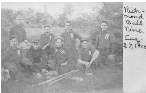
"Richmond Ball Nine, Aug. 27, 1905,"

We are pleased to announce that our circulation remained steady throughout the year with 3,310 transactions and 524 registered borrowers. Downloadable audio books and ebooks became even more important during this time with 614 transactions. Our holdings increased slightly, ending the year with 10,565 items.