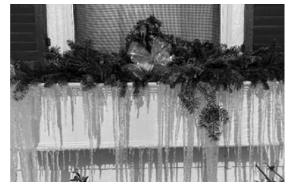
New Window Boxes at the Library