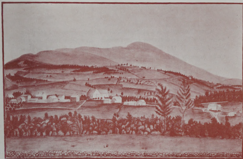
"Old" Main Street, circa 1845