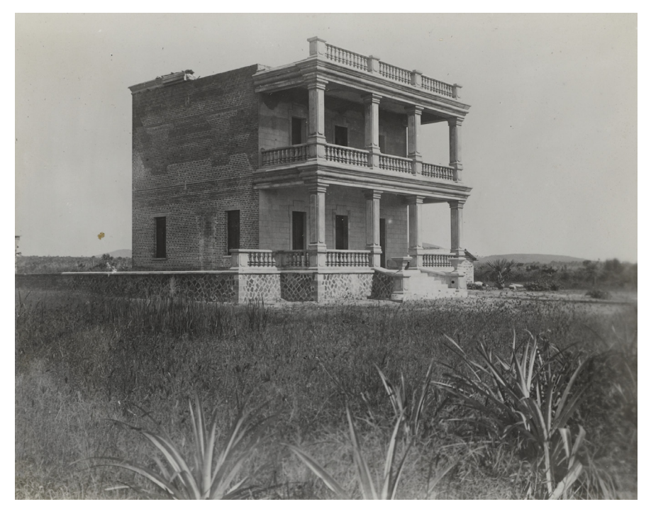
Figure 1. Chief Engineer's Residence, Kongolo, Belgian Congo, 1913.

labour from the territory than drawing labour into it during the early colonial period. As well as its status as a potential pool of labour, whose population typically disappointed recruiters such as the Katangese Labour Exchange, Kongolo became a railway junction for the Great Lakes Railway Company (Compagnie des Chemins de Fer du Congo Supérieur aux Grands Lacs Africans, CFL). The CFL first built a station in Kongolo in 1910 and this was an important moment as far as the history of its relationship with Belgian colonialism was concerned given that this greatly intensified European presence in the territory.<sup>20</sup> Aside from missionaries, more colonial administrators, for example, were stationed in the region after the construction of the railway junction.