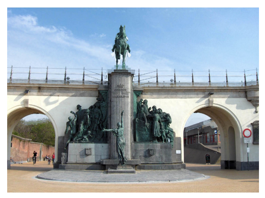
Figure 1. Statue of King Leopold II, Ostend, Belgium, 1931.

that from 'the 1910s Belgian historians gradually began to glorify the deceased king in order to justify the purchase of the colony', by convincing the public that the 'wild Africans' needing 'to be dressed, missionised and civilised'.<sup>12</sup> Castryck suggests that even 1970s school textbooks continued to present this image of 'Belgian heroism, until Congo disappeared from history courses altogether'.<sup>13</sup>