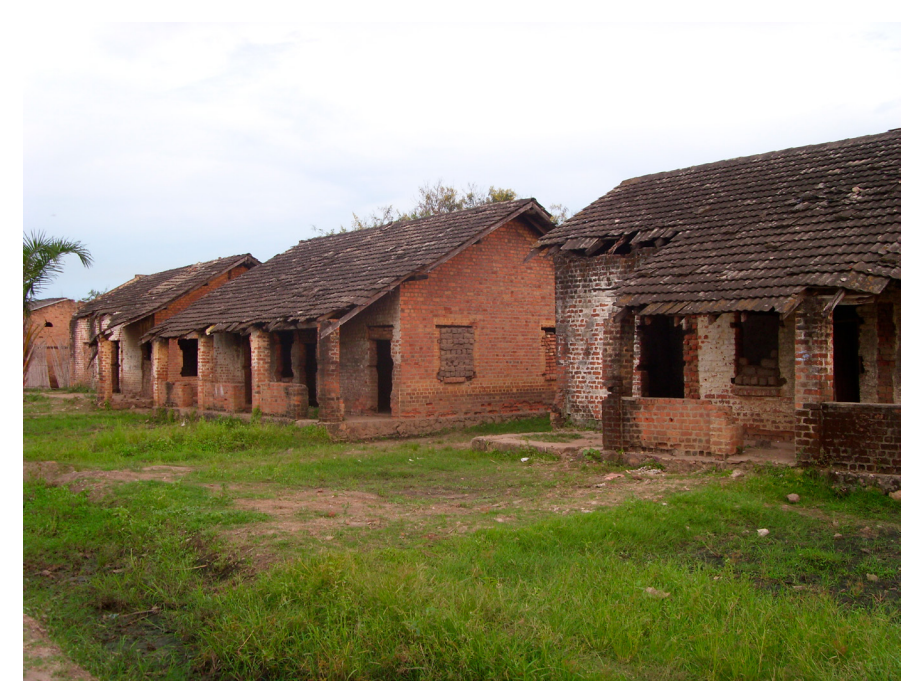
Figure 4. Houses in the CFL Camp, Kongolo, DRC, 7 May 2009.

cost of renting a six-room house in the CFL camp is around 30,000 Congolese Francs (CFs) whereas a house with three rooms costs fifteen thousand for the same period. Given that two thousand CFs are equivalent to $1, the accommodation in the camp ranges from $8 to $15 a month.<sup>37</sup> But this figure, which might appear cheap by Western European standards, would absorb half of the average monthly wage of a teacher in as of 2006 – only three years before the photo in Figure 4 was taken.<sup>38</sup> As such, most residents of Kongolo and its environs could simply not afford to live there.