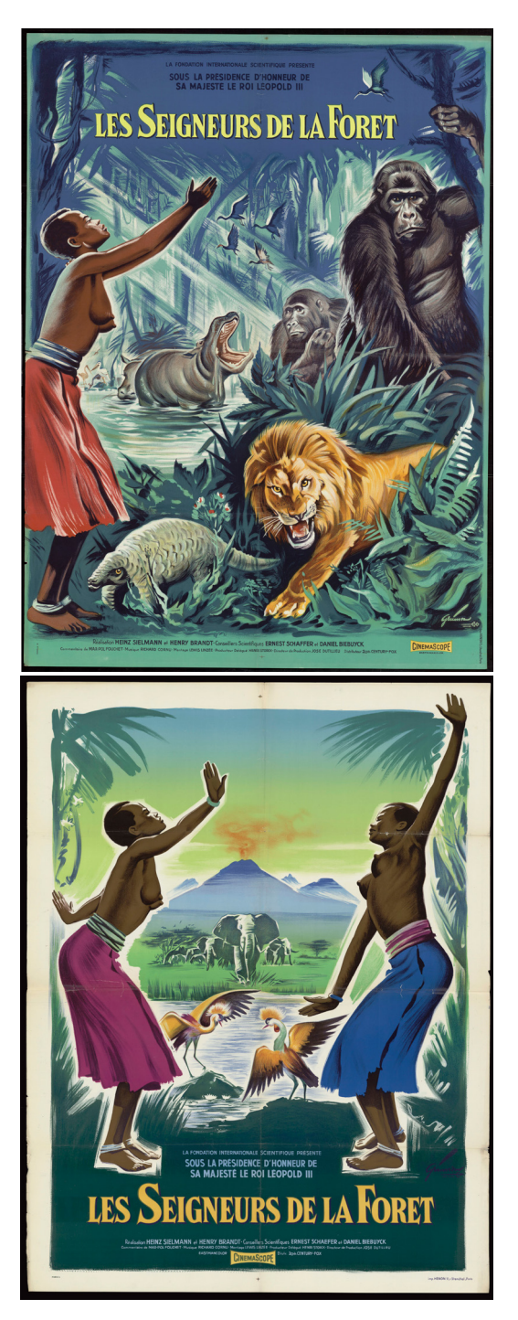
Figure 1 Two posters from Les seigneurs de la fôret [The Masters of the Congo Jungle], 1958.