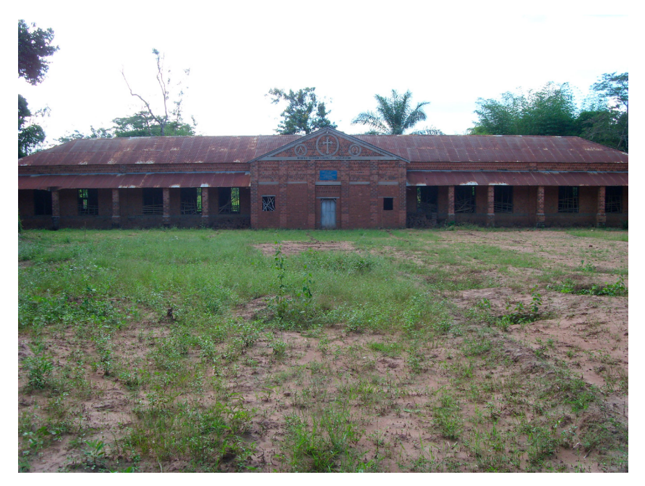
Figure 5. École Normale, Lubunda, DRC, 21 April 2009.

institute started life as the Collège Liberman, yet changed its name to Mwamba by the time that the Congo's ill-fated First Republic ended. The institute is staffed by clergy.<sup>61</sup> Thus, although the curriculum has most likely changed since the College Liberman days, the importance of Catholic clergy to its day-today functioning has remained an important characteristic of the facility. The Institut Mwamba is a vitally important secondary school given that it teaches approximately two thousand pupils every year.<sup>62</sup> It would be interesting to see exactly how much Catholic religion gets taught within the current curriculum and more research in this area would be welcome.