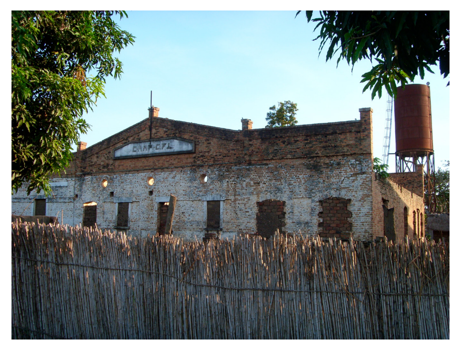
Figure 3. The Façade of the CFL Workers' Camp, Kongolo town centre, DRC, 23 April 2009.

disputes could be arranged in these spaces, and this happened in Kongolo at least during the late colonial period, they were generally easy to survey and so were never a focus of armed rebellion against the colonial state – even if the latter was often nervous about them acting as such.<sup>26</sup> As a result, the CFL camps falls firmly into Demissie's understanding of colonial architecture as serving to 'control and regulate spatially the existence of Africans in urban areas'.<sup>27</sup> Given the CFL's organisation of space, Demissie's thinking could equally apply to provincial areas as well, such as Kongolo's town centre.