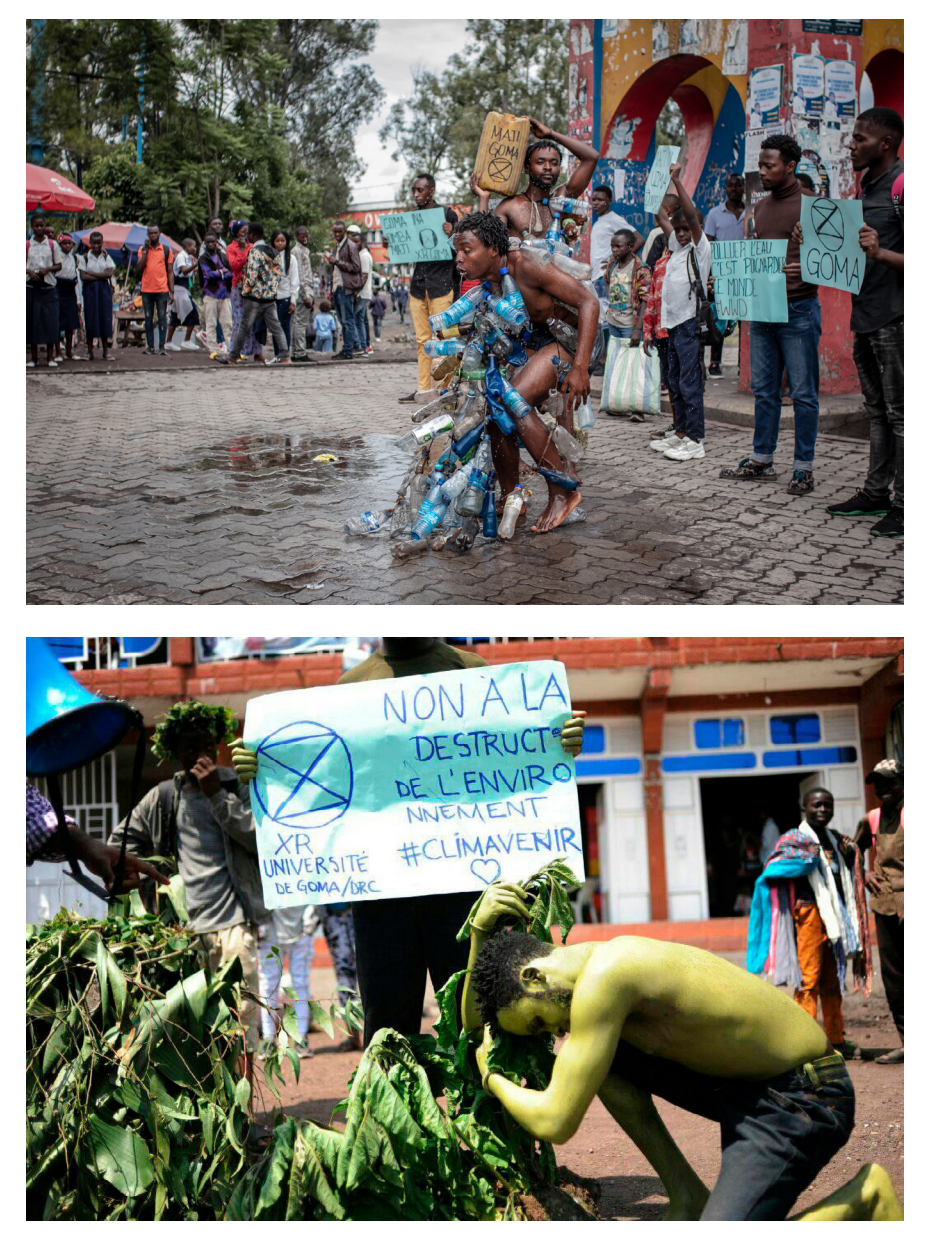
Figures 6-7. Extinction Rebellion Goma.