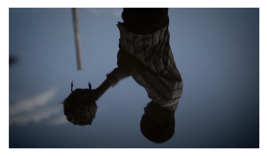
Figure 5. Still from the film Mother Nature. 0'36".