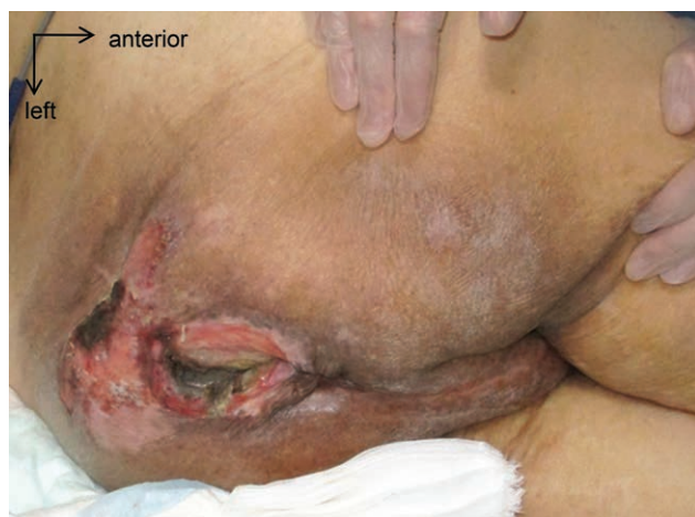
Fig. 1. Preoperative findings of a sacral pressure ulcer. The posterior part of the scrotum shows no erythema.

dl; PLT, 265,000/ \mu l; Alb, 1.9g/dl; CK, 531 U/l; Cre, 1.83 mg/dl; Na, 134 mEq/l; Glu, 115 mg/dl. The LRINEC (Laboratory Risk Indicator for Necrotizing Fasciitis) score was 10. Because there was no erythema or purpura near the sacral pressure ulcer and perineum part, antibiotic therapy was started under the suspicion of urinary catheter infection. (See figure, Supplemental Digital Content 1, which shows the findings on admission. http://links.lww.com/PRSGO/B668 .) Cefotiam was administered for 3 days; however, his blood data worsened (CRP, 25.0 mg/dl; WBC, 25,200/ \mu l; Hb, 8.5g/dl; Cre, 4.97 mg/dl; Na, 125 mEq/l; Glu, 114 mg/dl; LRINEC score, 12). Whole-body