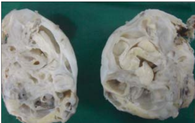
Figure 1: Gross: Cut surface of the tumour showing cystic and solid areas

The tumor weighed 300 gm and measured 14x8x7 cm. It was encapsulated, glistening white in appearance and partly cystic in nature. Cut section showed firm gray white areas mixed with myxoid areas [Figure 1]. Microscopy of the multiple sections studied showed a tumor composed of derivatives of all germ cell layers with no specific arrangement. Ectodermal elements seen were stratified squamous epithelium, columnar to cuboidal epithelium, pseudostratified squamous epithelium along with sebaceous glands and hair follicles [Figure 2]. Mesodermal elements in the tumor included well-