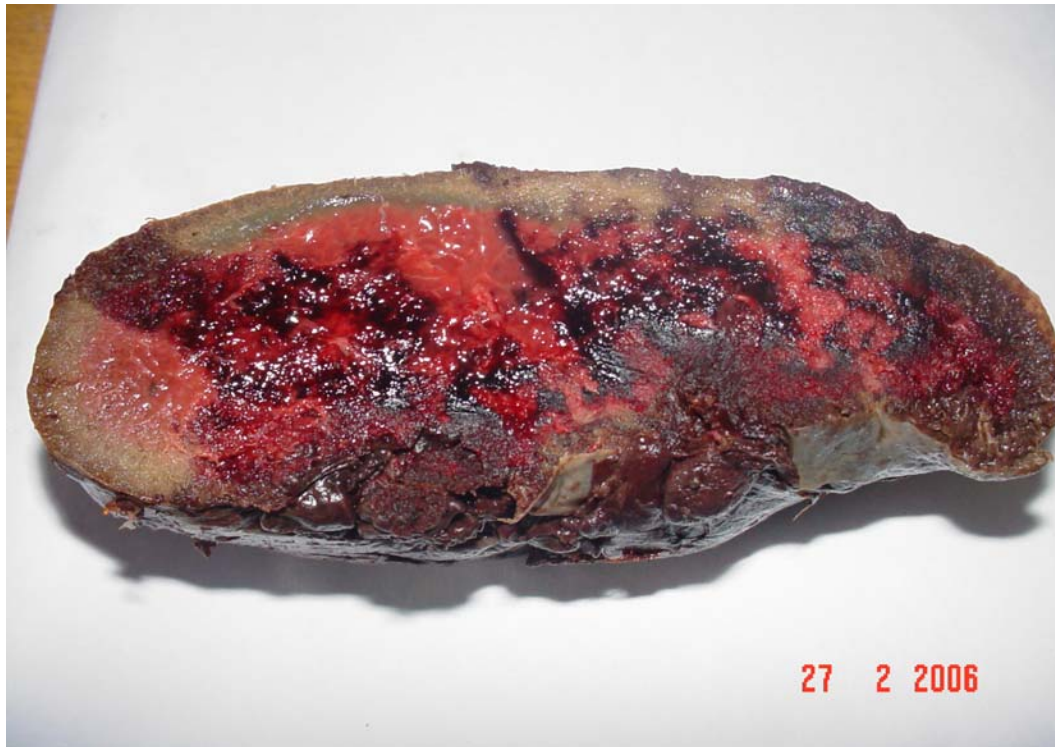
Fig 3: Cut surface of the spleen showing areas of haemorrhage and necrosis.