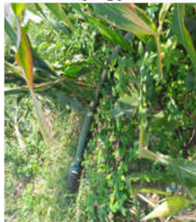
Plate 1: Irrigated maize farm with water from point C