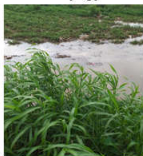
Plate 1: Sampling point C