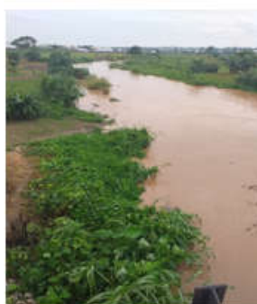
Plate 1: Sampling point B