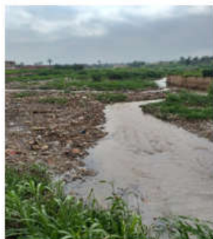
Plate 1: Sampling point A

A, point 'C' which was 500 m away from point B, and this was where farmers who have farms along the riverbank usually pump water to irrigate their farmlands (Plate 1). The collected water samples were kept in 4 liters capacity clean glass bottles stored at 4°C until further analyses.