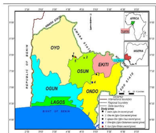
Fig 1: Map of South-western states, Nigeria, showing the location of the sacred groves with maps of Africa and Nigeria in inset (Oyelowo, 2014).

Igbo-Gbopo Sacred Grove, Aye, Ejigbo, Local Government, Osun State, Nigeria