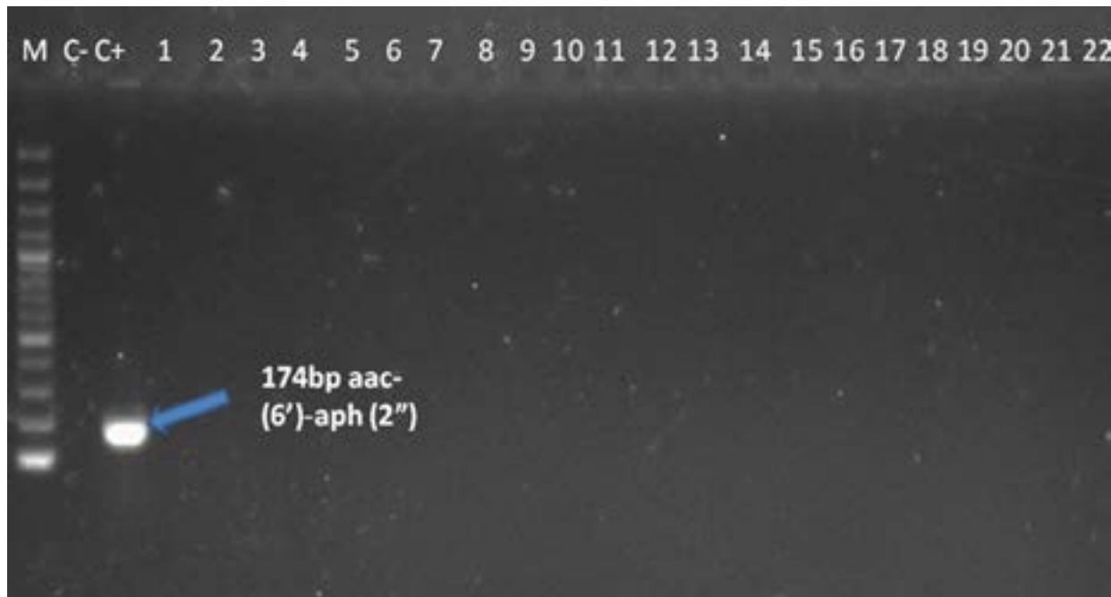
Figure 3: Amplification of aac-(6')-aph(2'') resistance gene in J. lividum (M: 100bp marker)