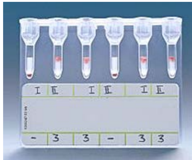
Figure 1: Antibody screening using the gel card

The frequency of anti E among the multi-transfused ESRD patients was 3.2% while the other antibodies each showed frequency of 0.8% each as shown in figure 2. Two of them had a titre of 1024 while the others had titres of 512 and 32 respectively. The multi-transfused pa-