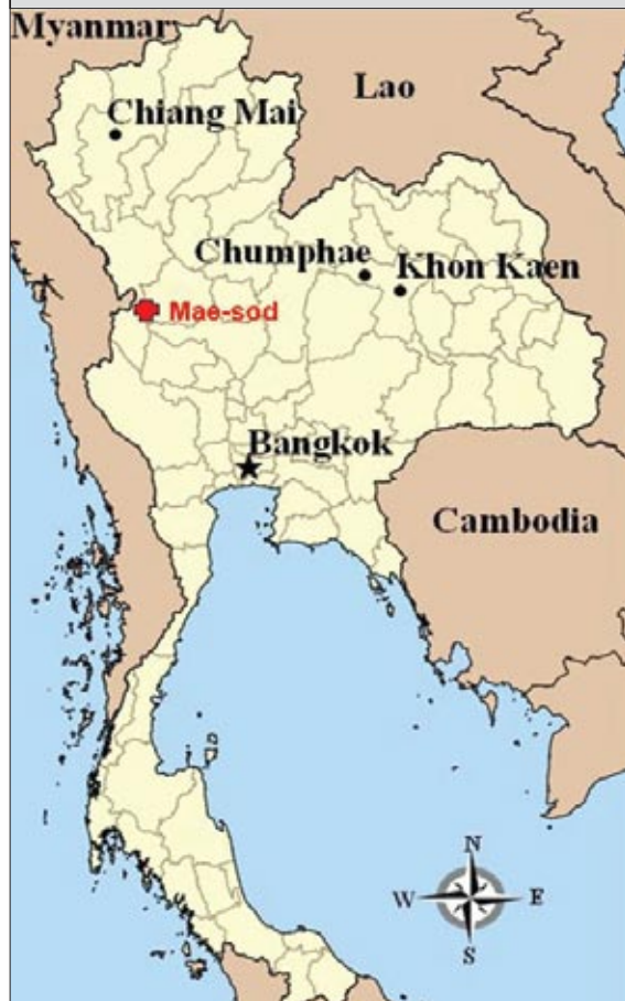
Fig. 1. Thailand is represented in yellow whereas its neighbouring countries, including Myanmar, Laos, and Cambodia, are represented in brown on the map. Mae-sod district in Tak province is in the border area between Thailand and Myanmar and is represented by a red cross

with acute illness who had attended the outpatient clinic or had been hospitalized at the Umphang Hospital, Tak, Thailand, during January 2009–June 2010.