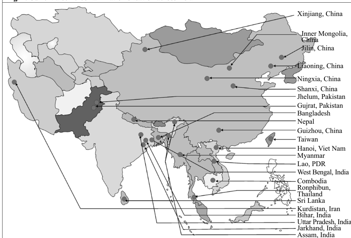
Fig. 2. Current arsenic-contamination situation across Asia

high concentrations of arsenic (100-2,000 \mu\text{g/L} ) in drinking-water were recorded during the 1930s (8).