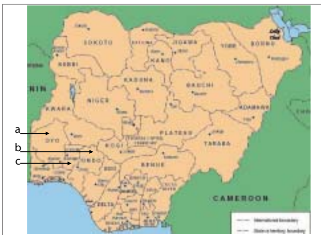
Figure 1: Map of Nigeria showing the states of the Federation. Data were collected from 3 states (arrowed) in Southwest Nigeria, (a) Oyo state, (b) Ekiti state and (c) Osun state. Igbo-Ora in Oyo state (a), has the highest rate of twinning in the country and worldwide

Most reports on incidence of twinning in southwest Nigeria are from data obtained at Ibadan and Igbo-Ora in Oyo state and Lagos state. [9-11,16] These are just two out of the six states that constitute the southwestern part of Nigeria. In this study, we present information on the incidence of twinning in Ogbomoso, the second largest town after Ibadan in Oyo state [Figure 1]; Ile-Ife and Ilesa towns in Osun state [Figure 1]; and Ado-Ekiti, the capital of Ekiti state [Figure 1]. It is hoped that data obtained will extend current knowledge on the frequency of twinning in southwest Nigeria and contribute to the demographic studies in the country.