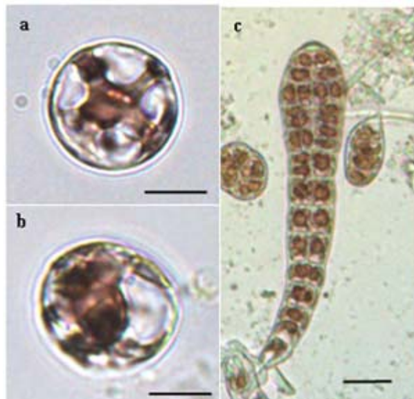
Figure 1. Comparison of the ability in regeneration of P. yezoensis protoplasts prepared by the treatment with AMX solution and allantoin. Scale bars: 20 \mu m.

(a) Protoplast prepared from gametophytic blades by treatment with AMX solution. No regeneration was observed.