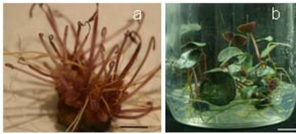
Figure 2. Regeneration of C. purpurascens on medium with 9.05 \mu\text{mol l}^{-1} 2,4-D und 3.94 \mu\text{mol l}^{-1} 2iP using protocol 1. (a) Formation of shoots on petioles; (b) Young plants in vitro on growth regulator-free medium. Bar. 10 mm (a, b).

1^{-1} BAP and 5.71 \mu\text{mol l}^{-1} IES. The N69 medium contained 10.74 \mu\text{mol l}^{-1} 1-naphtylacetic acid (NES) to induce root formation.