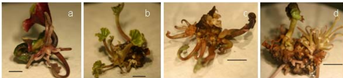
Figure 3. Formation of shoots in different Cyclamen species using protocol 2 after 14 weeks (cultivation for six weeks on N 69-medium (N69) with 6.66 \mu\text{mol l}^{-1} 6 Benzylaminopurine (BAP), 5.71 \mu\text{mol l}^{-1} Indolye-3 acedic acid (IES), 888.24 \mu\text{mol l}^{-1} Adenin followed by eight weeks on N 69 with 4.44 \mu\text{mol l}^{-1} BAP and 5.71 \mu\text{mol l}^{-1} IES using leaves (a-c) and peduncles (d). (a) C. purpurascens . (b) C. africanum . (c) C. hederifolium ssp. confusum . (d) C. persicum . Bar 10 mm (a-d).