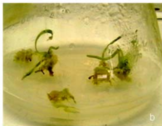
Figure 2. Callus induction and regeneration in different varieties of wheat.

(a) Callus induction in Chakwal-97 on media containing 3 mg/L 2,4-D.