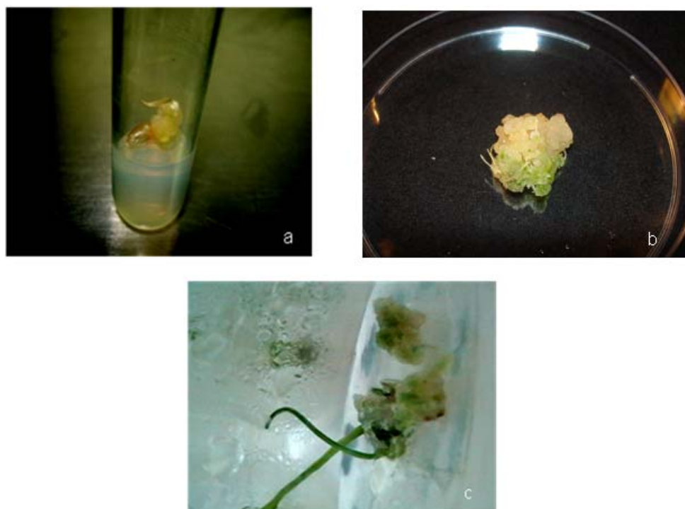
Figure 3. Callus induction and regeneration in different varieties of wheat.

When embryogenic calli were shifted to maintenance medium they proliferated. Some of the calli turned green in maintenance medium. These maintained calli were then transferred to regeneration medium. On MS medium