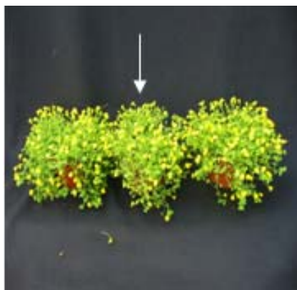
Figure 2. Ex vitro plants of M. Tenella . No differences in phenology and growth habit were observed between the ex vitro plants and the in vivo propagated plant (arrowed).

Table 1 shows the responses obtained when the nodal segments of M. tenella were cultured on a medium supplemented with different NAA/BAP combinations. The treatment containing 0.25 and 0.5 mg/L BAP showed the best multiplication rates, with values around thirty two shoots per explant. The result was similar in the treatment with 1.0 mg/L BAP, with approximately twenty nine shoots per explants. Conversely, the treatment without BAP or containing this growth regulator combined with NAA showed multiplication rates that never surpassed eleven shoots per explant, being the less efficient those containing 1.0 mg/L NAA/BAP with only one shoot per explant. Also, Table 1 shows that an increase in the NAA/BAP ratio provoked an increment in calli induction and in the number of rooted explants, but diminished the average of shoots per explant (descendent row in Table 1). The opposite situation, that is, decreasing the NAA/BAP ratio (horizontal row in Table 1), provoked changes in the appearance of the calli, becoming more compact, and an increment in the root thickness. Although the recovered shoots from all the treatments rooted spontaneously, including those treatments without NAA, at the earliest stage of the culture the