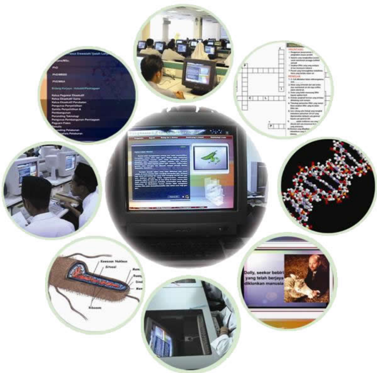
Figure 4. A montage of the multimedia kit distributed to the schools in the form of CDs which include information and trivia on biotechnology, animations explaining processes and procedures in a molecular biology laboratory, electronic crosswords and interactive molecular graphics visualization interface for virtually exploring a DNA molecule.

PCR (Polymerase Chain Reaction) (Figure 3). In these sessions the students are exposed to many basic procedures in a molecular biology laboratory. The resources required are minimal and can usually be obtained from a high school lab or the kitchen. Chemicals, reagents and equipment such as agarose, restriction enzymes and electrophoresis sets are provided by the facilitators. These are funded by the Ministry of Science, Technology and Innovation. The main purpose of these hands on activities was to simply demonstrate that all living organisms carried molecular genetic material (nucleic acids) which can be extracted and analyzed. These sessions also include discussions as to how the genetic material could be used for differentiation