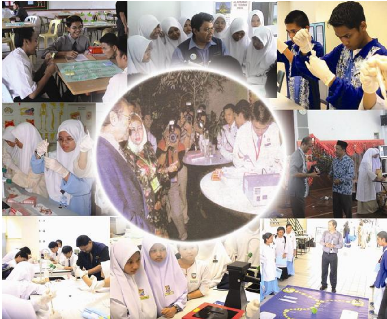
Figure 3. A montage of the activities carried out in the Malaysian High Schools Biotechnology Awareness program and serves to illustrate the interaction that was achieved by practicing scientists, senior academics and the target high school students during the course of the sessions. The central insert shows the Hon. Dr. Mahathir Mohammad, former Primer Minister of Malaysia, observing the students extracting chromosomal DNA from onions.

sessions were either good or excellent and the time that was allocated for each session was satisfactory (Figure 2b).