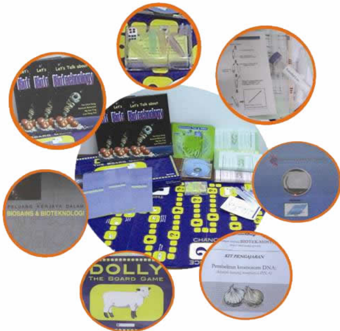
Figure 1. Montage of the kits and logistics which are distributed to the participating schools including career guidance pamphlets, games, DNA extraction kits (for onion chromosomal DNA), CDs and literature packages.

The policy makers are faced with the problem of responsibly educating the Malaysian public, while at the same time seeding the grassroots with the prospects of careers in biotechnology research and industry. It was deemed that one feasible and effective way of doing this was by embarking on a biotechnology awareness program targeted at students of Malaysian high schools. This decision was made considering that the final years of high school is usually a time when students start thinking about true career directions as opposed to just childhood dreams. This age range was also selected when taking into account the maturity of the students, to begin comprehending modern biotechnology, and at the same time, this age range was also deemed suitable as students of this age group are generally vocal and critical enough to disperse the