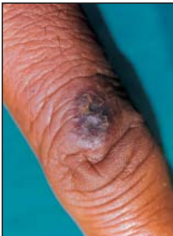
Figure 1: Dorsa of the finger showing an umbilicated nodule