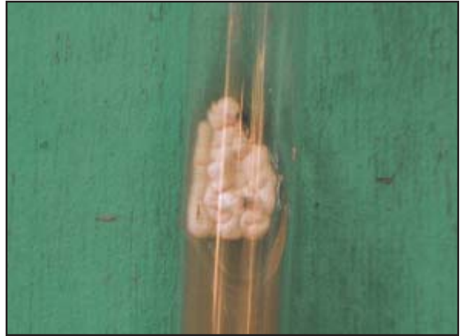
Figure 2: Characteristic cottony white colonies of Histoplasma capsulatum

or any other detectable systemic abnormality. Her general health was good.