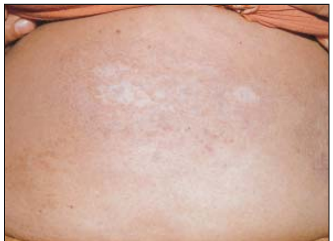
Figure 4: Complete clearing after 16 weeks of itraconazole therapy

H. capsulatum is an intracellular organism parasitizing the reticuloendothelial system and involving the spleen,