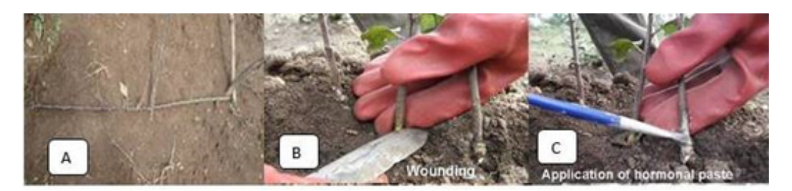
Figure 1. Defoliated apple rootstocks pegged into a trench (A), girdling of three months old sprouts (B) and application of IBA hormone on sprouts (C) in the trench layering nursery at Bugongi - KAZARDI in South-Western Uganda.

Data collection. Data were recorded for rooting percentage, root numbers ( average