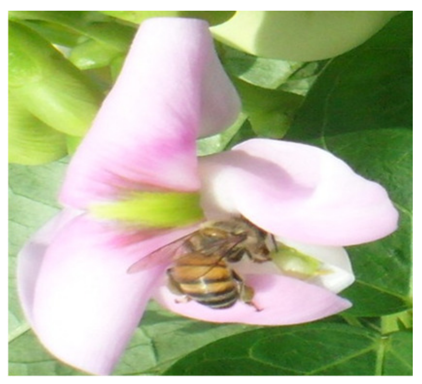
Figure 2. Pollination of African yam bean flower by a bumblebee