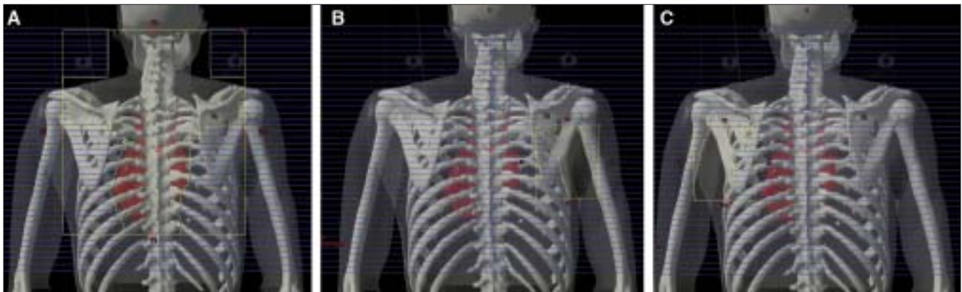
Figure 2: (A) Central posterior MLC subfield; (B) Right posterior MLC subfield; (C) Left posterior MLC subfield

defined in the mid-plane for the three MLC subfields and the dose was prescribed to their respective reference points. The whole treatment was performed in the SAD technique. For inhomogeneity correction, equivalent tissue-air ratio method was used for dose calculation. Summation of the three anterior subfields and their matching was verified by exposing an enhanced dose range (EDR) film.