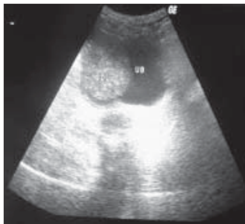
Figure 1: USG showing bladder SOL antero-lateral wall

In literature review, we found only six cases of a