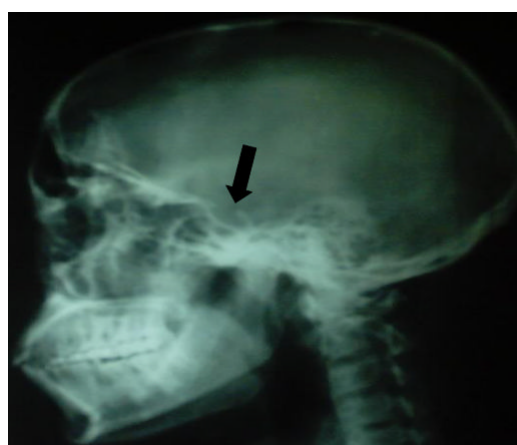
Figure 3. Lateral skull radiograph of a 34-year-old man showing flat type of sella turcica with a concavo-convex floor anteroposteriorly