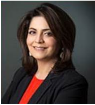
State Network (Bone and Parathyroid Disease State Network and Diabetes Disease State Network) for the 2019-2020 year Association of the American Association of Clinical Endocrinology AACE.