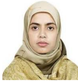
Association of Clinical Endocrinologists annual meeting held in Los Angeles last month.