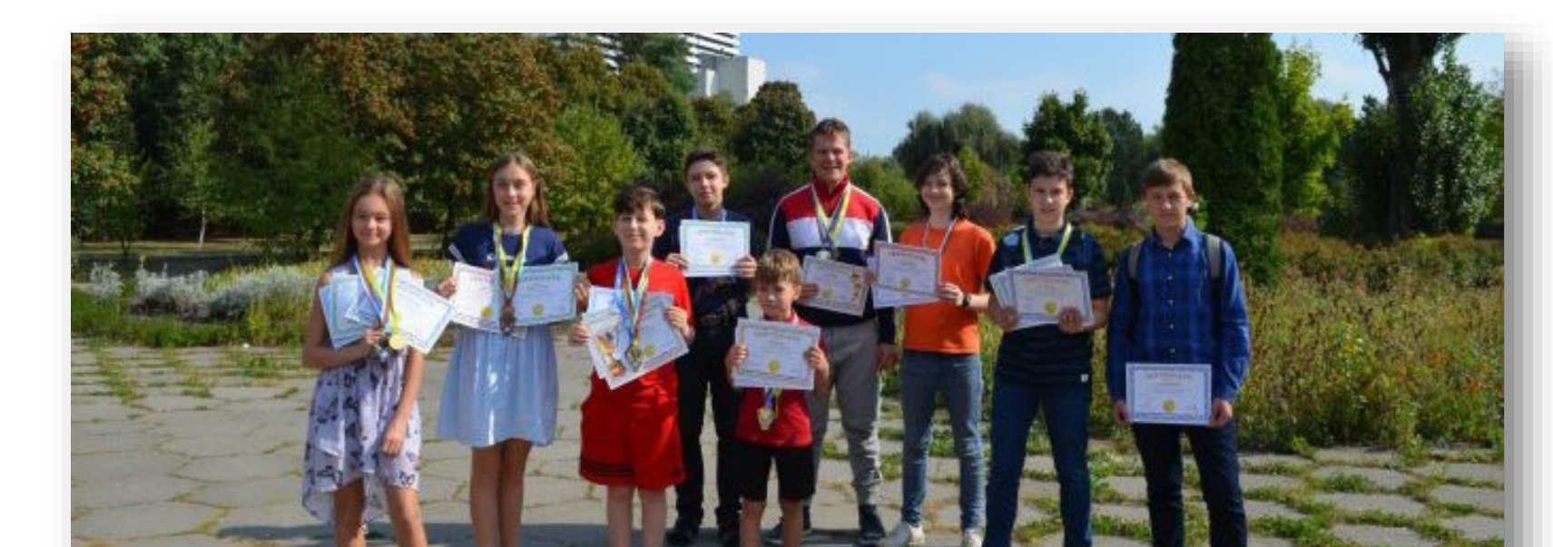
International Olympiad "Mathematics without Borders"