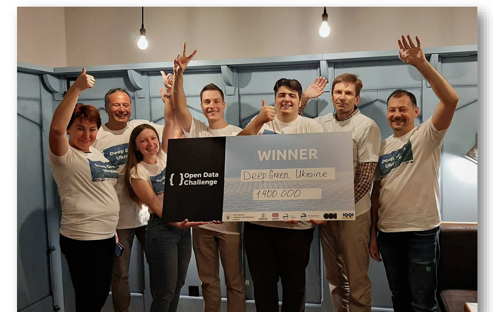
Grant under the "Open Data Challenge"