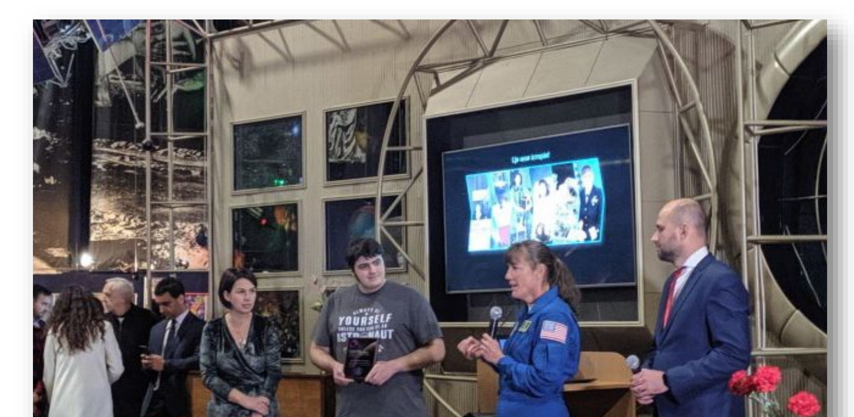
Master class on satellite analysis of the ecological situation of the Earth for schoolchildren