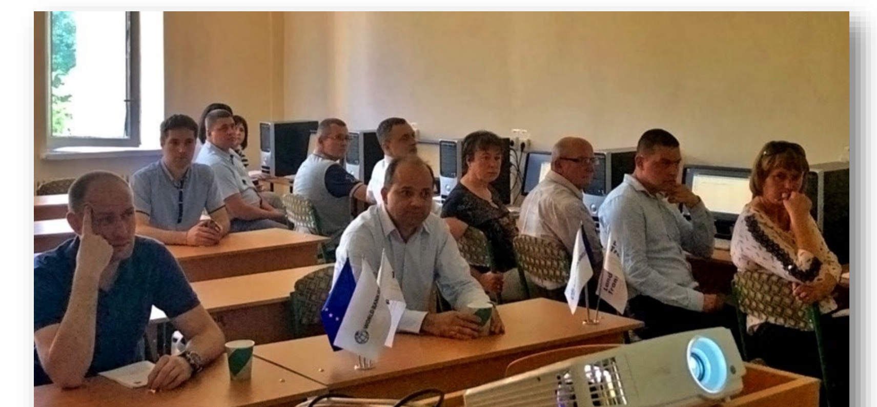
GIS training technologies for government