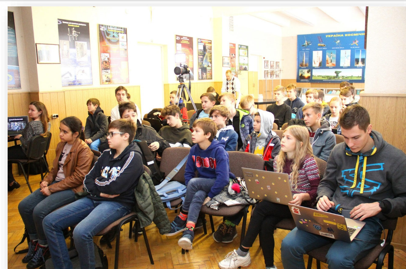
Meet and Code