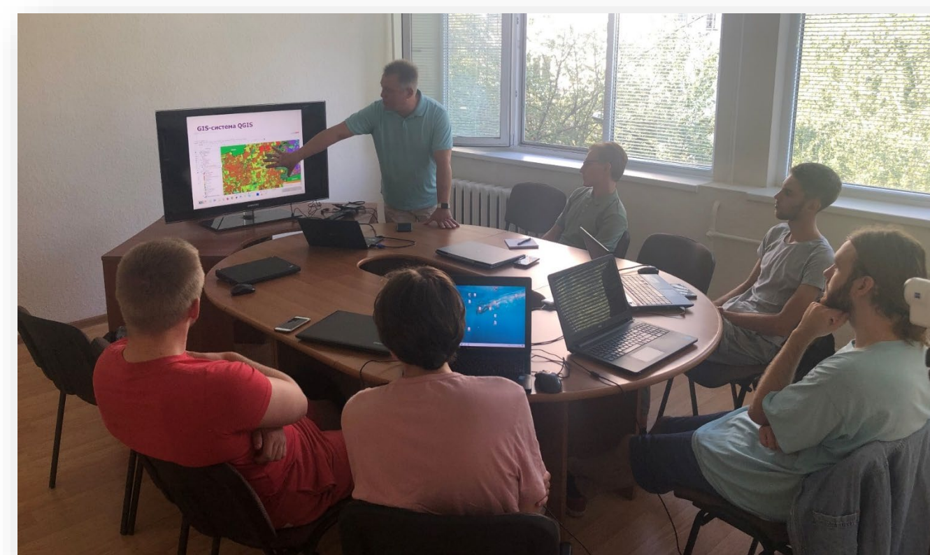
Educational process, GIS technologies