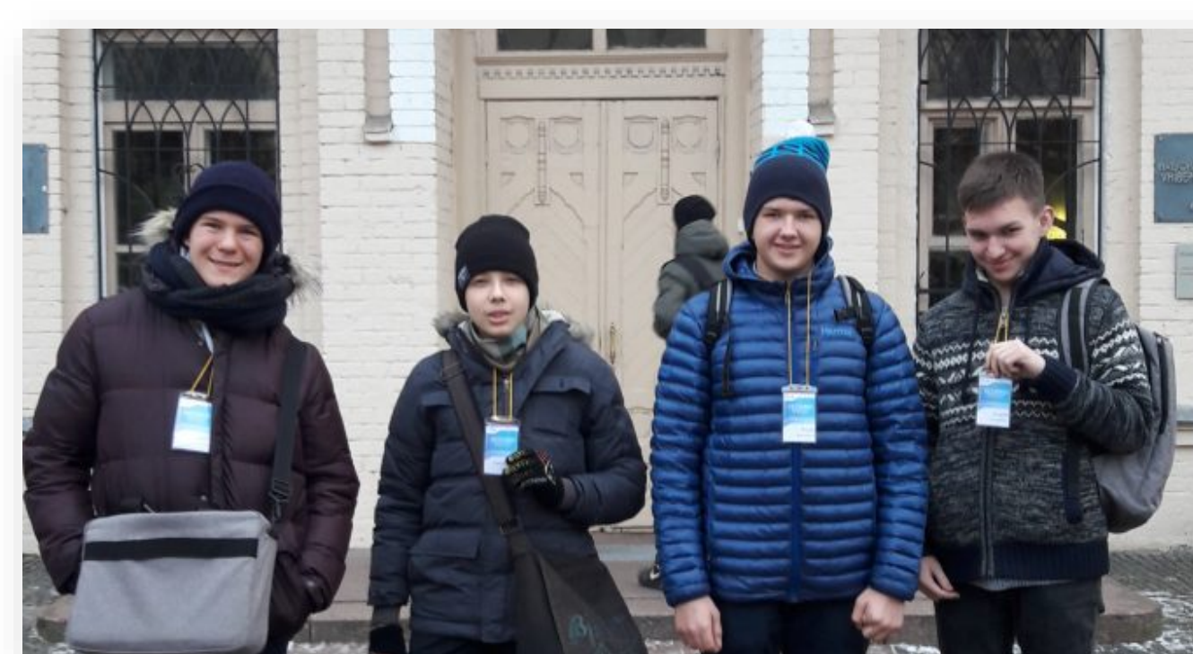
Techno Ukraine 2020