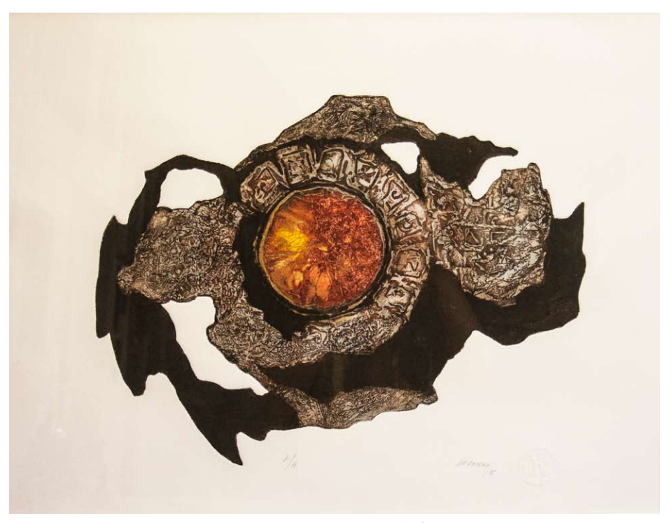
"Birth of an asteroid", collagraph. Marta Arangoa

In this same act, the dialogical dialectic of the humanizable act is re-inaugurated, which questions the possibility of the knowledgeable as a condition of psychosocial complexation. This is conceived as an extension of the representational field in the development of reflexive processes, which places self-consciousness in relation with others and the world. In this manner, education deploys the humanizable side of what is human in terms of the acknowledgement of acquisitions that leave a trace in the subject's conscience. Such conscience locates subjects as the core components of social action and as predicates of their practices (Charaudeau, 2009).